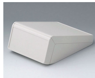
B4056127 UNITEC M, 1.4/0.6 ABS (UL 94 HB) off-white RAL 9002 148x210x80mm IP 40