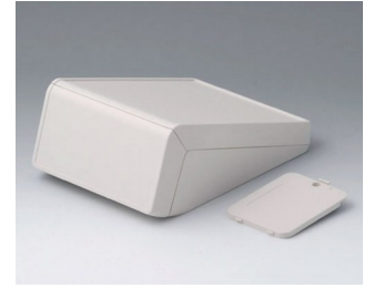
B4056237 UNITEC M, 0.6/1.4 ABS (UL 94 HB) off-white RAL 9002 148x210x80mm IP 40