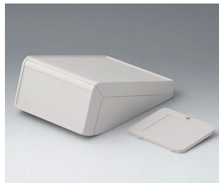
B4056317 UNITEC M, 1.4/1.4 ABS (UL 94 HB) off-white RAL 9002 148x210x80mm IP 40