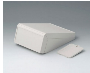
B4054227 UNITEC S, 1.4/0.6 ABS (UL 94 HB) off-white RAL 9002 125x177x69mm IP 40