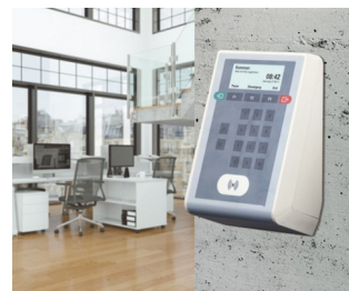
Time recording terminal