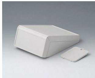
B4054217 UNITEC S, 1.4/1.4 ABS (UL 94 HB) off-white RAL 9002 125x177x69mm IP 40