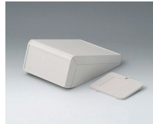
B4054327 UNITEC S, 1.4/0.6 ABS (UL 94 HB) off-white RAL 9002 125x177x69mm IP 40