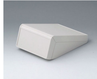
B4054127 UNITEC S, 1.4/0.6 ABS (UL 94 HB) off-white RAL 9002 125x177x69mm IP 40