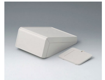
B4054337 UNITEC S, 0.6/1.4 ABS (UL 94 HB) off-white RAL 9002 125x177x69mm IP 40