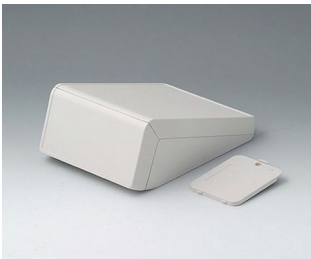
B4054207 UNITEC S, 0.6/0.6 ABS (UL 94 HB) off-white RAL 9002 125x177x69mm IP 40