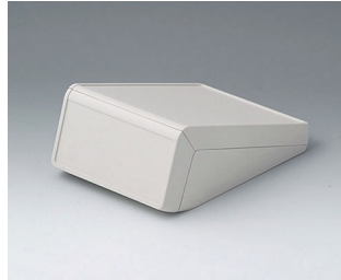
B4054117 UNITEC S, 1.4/1.4 ABS (UL 94 HB) off-white RAL 9002 125x177x69mm IP 40