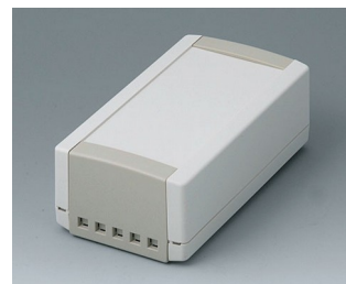
B1060465 TOPTEC 154 H, Vers. II ABS (UL 94 HB) off-white RAL 9002 154x84x56mm IP 40