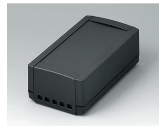
B1060469 TOPTEC 154 H, Vers. II ABS (UL 94 HB) black RAL 9005 154x84x56mm IP 40