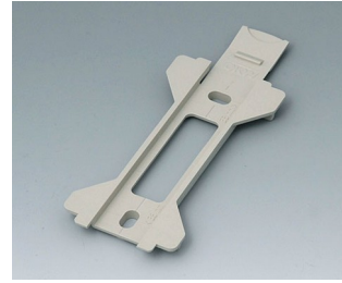
B1360028 Wall suspension element for Toptec 154 PC+ABS (UL 94 V-0) pebble grey RAL 7032