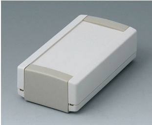
B1040365 TOPTEC 102, Vers. I ABS (UL 94 HB) off-white RAL 9002 102x54x30mm IP 40