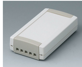
B1055465 TOPTEC 123 F, Vers. II ABS (UL 94 HB) off-white RAL 9002 123x68x30mm IP 40