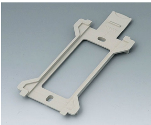
B1370028 Wall suspension element for Toptec 194 PC+ABS (UL 94 V-0) pebble grey RAL 7032