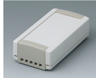
B1040465 TOPTEC 102, Vers. II ABS (UL 94 HB) off-white RAL 9002 102x54x30mm IP 40