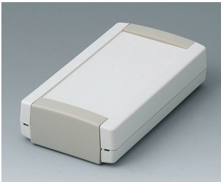
B1055365 TOPTEC 123 F, Vers. I ABS (UL 94 HB) off-white RAL 9002 123x68x30mm IP 40