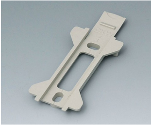
B1350028 Wall suspension element for Toptec 123 PC+ABS (UL 94 V-0) pebble grey RAL 7032