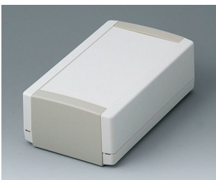
B1070365 TOPTEC 194 H, Vers. I ABS (UL 94 HB) off-white RAL 9002 194x115x68mm IP 40