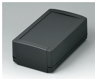
B1070369 TOPTEC 194 H, Vers. I ABS (UL 94 HB) black RAL 9005 194x115x68mm IP 40