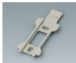
B1340028 Wall suspension element for Topotec 102 PC+ABS (UL 94 V-0) pebble grey RAL 7032