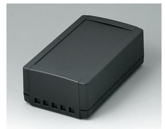
B1070469 TOPTEC 194 H, Vers. II ABS (UL 94 HB) black RAL 9005 194x115x68mm IP 40