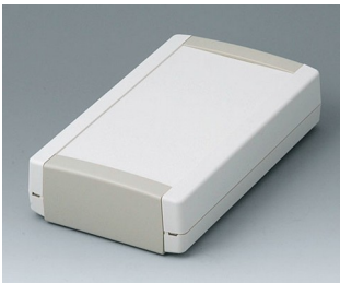
B1075365 TOPTEC 194 F, Vers. I ABS (UL 94 HB) off-white RAL 9002 194x115x46mm IP 40