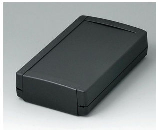
B1075369 TOPTEC 194 F, Vers. I ABS (UL 94 HB) black RAL 9005 194x115x46mm IP 40