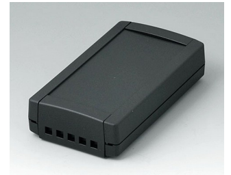
B1055469 TOPTEC 123 F, Vers. II ABS (UL 94 HB) black RAL 9005 123x68x30mm IP 40