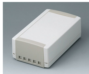
B1070465 TOPTEC 194 H, Vers. II ABS (UL 94 HB) off-white RAL 9002 194x115x68mm IP 40