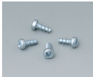
A9199008 Set of screws