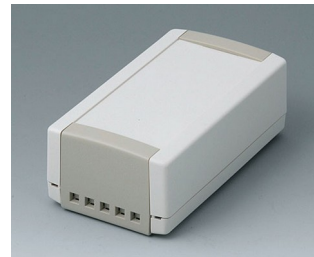
B1050465 TOPTEC 123 H, Vers. II ABS (UL 94 HB) off-white RAL 9002 123x68x45mm IP 40