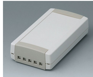
B1065465 TOPTEC 154 F, Vers. II ABS (UL 94 HB) off-white RAL 9002 154x84x38mm IP 40