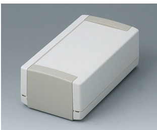
B1060365 TOPTEC 154 H, Vers. I ABS (UL 94 HB) off-white RAL 9002 154x84x56mm IP 40