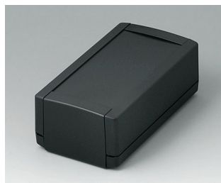
B1060369 TOPTEC 154 H, Vers. I ABS (UL 94 HB) black RAL 9005 154x84x56mm IP 40