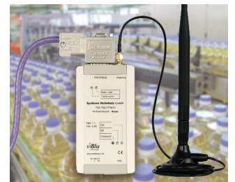
PROFIBUS radio system