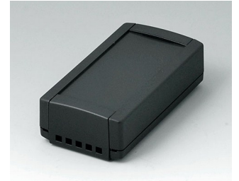
B1040469 TOPTEC 102, Vers. II ABS (UL 94 HB) black RAL 9005 102x54x30mm IP 40