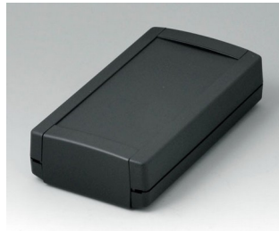
B1065369 TOPTEC 154 F, Vers. I ABS (UL 94 HB) black RAL 9005 154x84x38mm IP 40