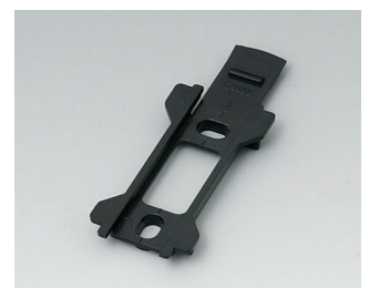
B1340029 Wall suspension element for Topotec 102 ABS (UL 94 HB) black RAL 9005