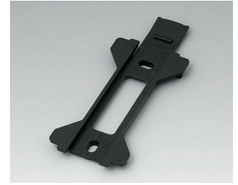
B1360029 Wall suspension element for Toptec 154 ABS (UL 94 HB) black RAL 9005