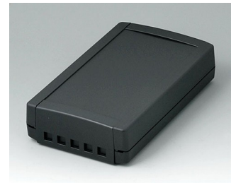
B1075469 TOPTEC 194 F, Vers. II ABS (UL 94 HB) black RAL 9005 194x115x46mm IP 40