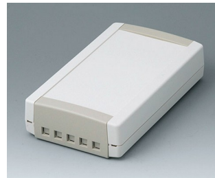
B1075465 TOPTEC 194 F, Vers. II ABS (UL 94 HB) off-white RAL 9002 194x115x46mm IP 40