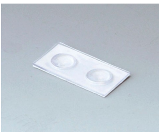
A9207150 Anti-slide feet 6.5 x 2 mm transparent

Subject to technical modification without notice. © by OKW Gehäusesysteme, Buchen/Germany.