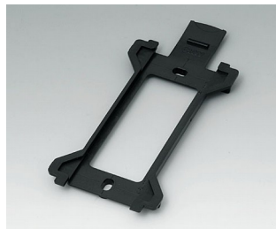
B1370029 Wall suspension element for Toptec 194 ABS (UL 94 HB) black RAL 9005