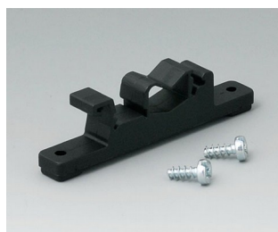
B1300019 Fastening element for DIN-Rails PA 6 black RAL 9005