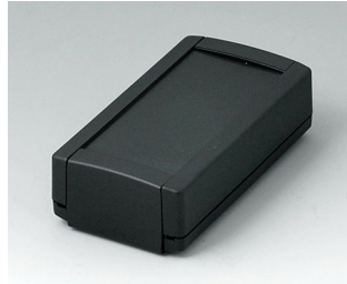
B1040369 TOPTEC 102, Vers. I ABS (UL 94 HB) black RAL 9005 102x54x30mm IP 40