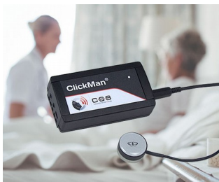
Adaptive multicontroller for single sensors