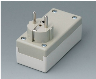
A9011665 PLUG CASE F / D, Vers. I PC+ABS (UL 94 V-0) off-white RAL 9002 100x50x40mm