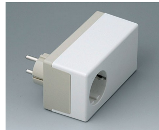
A9022465 PLUG CASE D, Vers. II PC+ABS (UL 94 V-0) pebble grey RAL 7032 120x65x55mm