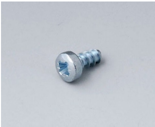
A0306031 Self-tapping screws 3 x 6 mm (PZ1)