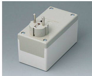
A9021665 PLUG CASE F / D, Vers. I PC+ABS (UL 94 V-0) pebble grey RAL 7032 120x65x65mm