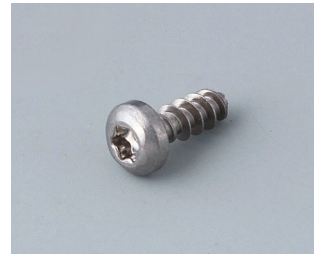
A0308132 Self-tapping screw 3 x 8 mm (T10) Stainless steel

Subject to technical modification without notice. © by OKW Gehäusesysteme, Buchen/Germany.