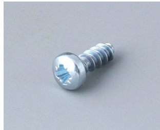
A0308031 Self-tapping screws 3 x 8 mm (PZ1)