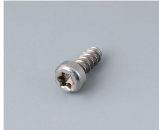
A0325060 Self-tapping screw 2.5 x 6 mm (T8) Stainless steel