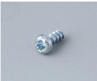
A0304031 Self-tapping screws 2.2 x 5 mm (PZ1)