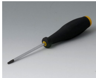
A0399T08 Torx T8 screwdriver