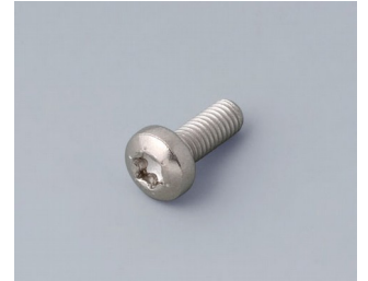
A0330080 Screw M3 x 8 mm (T10) Stainless steel