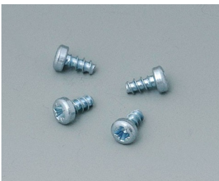
B5111201 Set of screws