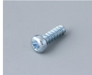
A0325080 Self-tapping screws 2.5 x 8 mm (PZ1)