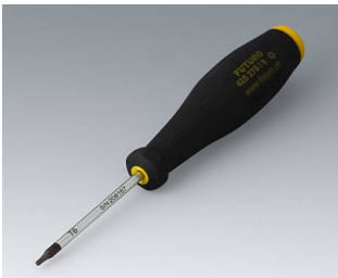
A0399T06 Torx T6 screwdriver