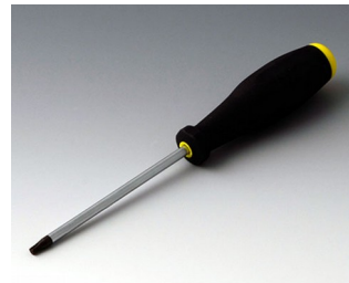
A0399T20 Torx T20 screwdriver