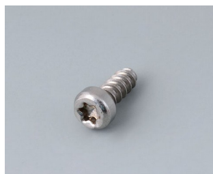
A0325060 Self-tapping screw 2.5 x 6 mm (T8) Stainless steel