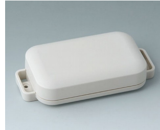
C3206107 EASYTEC 100 ASA+PC (UL 94 V-0) off-white RAL 9002 121x62x26mm IP 65 opt., IP 40