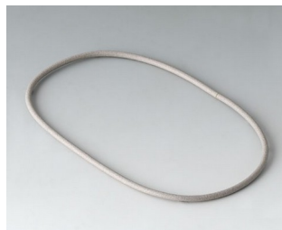
A9502030 Sealing 100