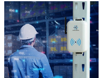
Smart store logistics