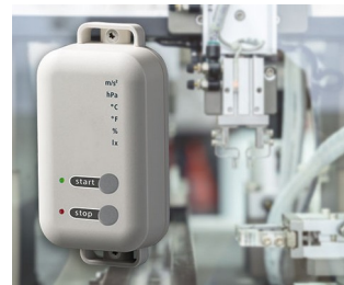
Data logger with gateway function