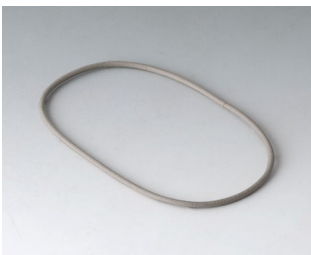
A9500030 Sealing 80