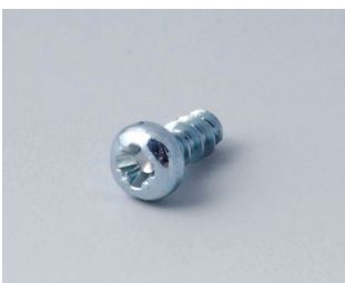
A0305031 Self-tapping screws 2.5 x 6 mm (PZ1)