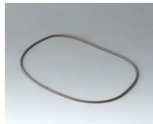
A9503030 Sealing 125