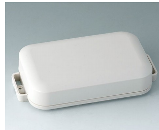
C3208107 EASYTEC 150 ASA+PC (UL 94 V-0) off-white RAL 9002 172x93x36mm IP 65 opt., IP 40