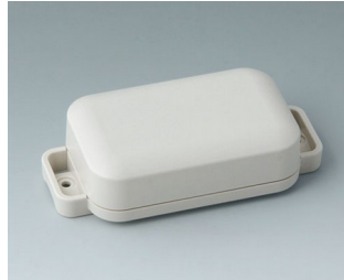
C3204207 EASYTEC 80 ASA+PC (UL 94 V-0) off-white RAL 9002 101x50x26mm IP 65 opt., IP 40