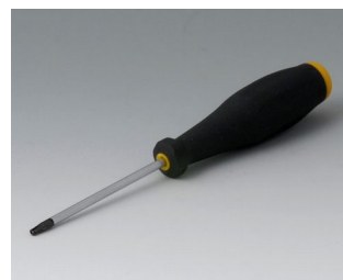
A0399T08 Torx T8 screwdriver