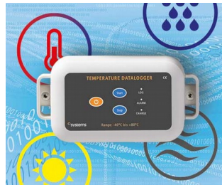
Data logger e.g. for temperature