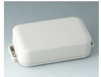
C3208207 EASYTEC 150 ASA+PC (UL 94 V-0) off-white RAL 9002 172x93x46mm IP 65 opt., IP 40