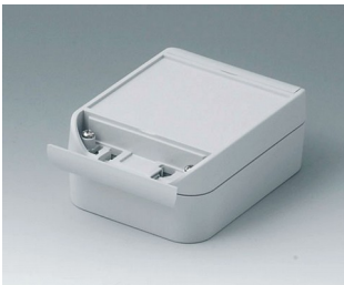
C6009121 SMART-BOX WIDTH 90 ASA+PC (UL 94 V-0) light grey RAL 7035 120x90x50mm IP 66