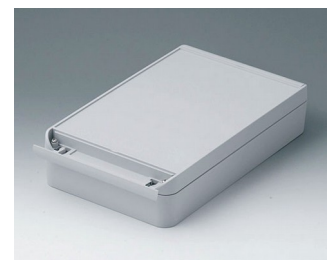
C6017281 SMART-BOX WIDTH 170 ASA+PC (UL 94 V-0) light grey RAL 7035 280x170x60mm IP 65