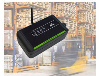
Pedestrian Alert System