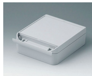
C6015181 SMART-BOX WIDTH 150 ASA+PC (UL 94 V-0) light grey RAL 7035 180x150x60mm IP 66