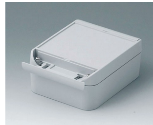
C6011141 SMART-BOX WIDTH 110 ASA+PC (UL 94 V-0) light grey RAL 7035 140x110x60mm IP 66