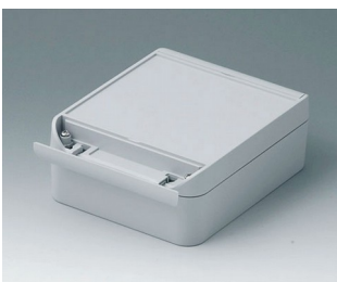
C6013161 SMART-BOX WIDTH 130 ASA+PC (UL 94 V-0) light grey RAL 7035 160x130x60mm IP 66