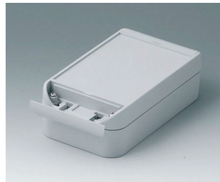
C6009161 SMART-BOX WIDTH 90 ASA+PC (UL 94 V-0) light grey RAL 7035 160x90x50mm IP 66