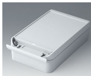
C6013221 SMART-BOX WIDTH 130 ASA+PC (UL 94 V-0) light grey RAL 7035 220x130x60mm IP 66