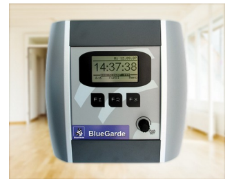
House control unit