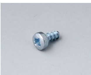
A0306031 Self-tapping screws 3 x 6 mm (PZ1)