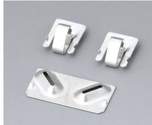
A9190002 Set of battery clips, 2xN/2xAA/2xAAA Steel tin-plated