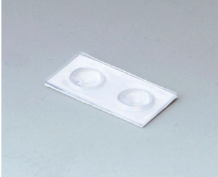
A9207150 Anti-slide feet 6.5 x 2 mm transparent