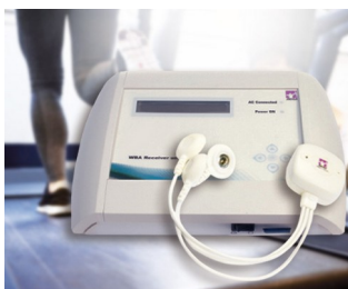
WBA receiver unit for measuring biosignals