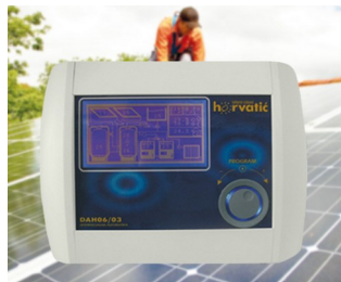
Control unit for photovoltaic solar installations