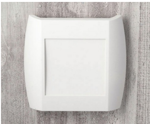
A9092107 DIATEC XS ABS (UL 94 HB) off-white RAL 9002 150x37x155mm IP 40