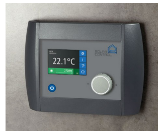
Solar Control Panel