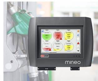
Controller for intelligent tank management