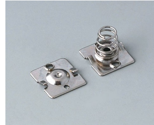
A9190015 Set of battery clips, 2 x AA Steel nickel-plated