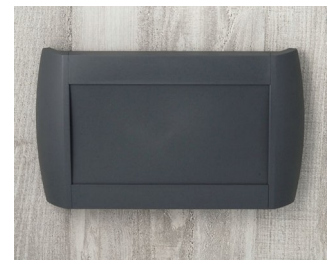
A9095108 DIATEC L ABS (UL 94 HB) lava 330x48x200mm IP 40