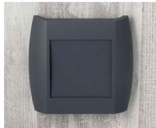
A9092108 DIATEC XS ABS (UL 94 HB) lava 150x37x155mm IP 40