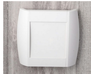
A9093107 DIATEC S ABS (UL 94 HB) off-white RAL 9002 210x48x200mm IP 40