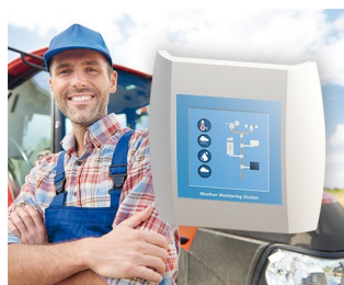
Weather Monitoring Station