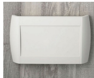
A9095107 DIATEC L ABS (UL 94 HB) off-white RAL 9002 330x48x200mm IP 40