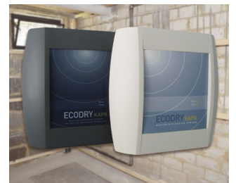
Systems for drying brickwork