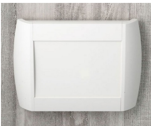
A9094107 DIATEC M ABS (UL 94 HB) off-white RAL 9002 270x48x200mm IP 40